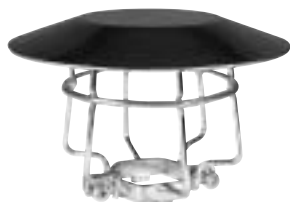
V34 Intermediate Upright Guard