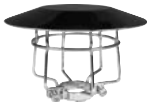
V27 Intermediate Upright Guard

The Models V27 and V34 Sprinkler Guards are designed to protect the sprinkler from mechanical damage. Each guard is constructed from chrome plated steel wire welded to steel plates.