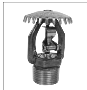
Model G XLO Upright

Note: This product has been tested and listed for storage applications to qualify its use in lieu of 5.6K or 8.0K Factor sprinklers for the protection of high-piled storage.