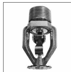
Model G XLO Pendent